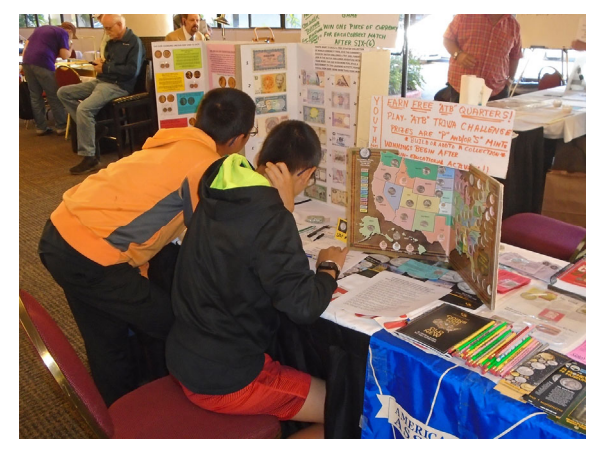
These two YNs working together on the Foreign Currency Country Match Game in Portland earned 25 of 33 pieces of currency.