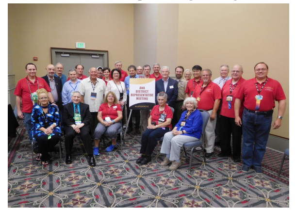
District & Club Rep annual group photo, taken on Aug. 18 in Philadelphia.